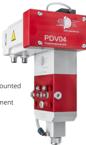
PDV04 with mounted spray attachment